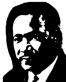
Martin Luther King, Christian socialist

Some Marxists have also overestimated the centrality of work to identity. Community, ethnic, and regional identities have often competed with class loyalties. Racial divisions and the initial organization of immigrants into ethnic-based political machines rather than class-conscious parties have weakened class identity in the United States. Democratic socialists recognize the pre-capitalist origins of racism and sexism. While capitalism clearly structures these forms of oppression (for example, the use of racism and sexism to channel women and minorities into low-paying, service sector jobs), there is a relatively autonomous cultural and psychological dimension to these forms of domination. Socialist-feminists analyze how the sexual division of labor in child rearing produces different gendered attitudes towards nurturing and moral judgment. Socialist analyses of racism examine the psychological underpinnings of racism in cultural fears of "the other" and anxieties about group identity and status.