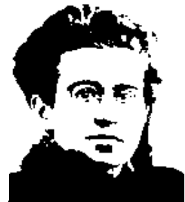
Antonio Gramsci, theorist of hegemony

Marx believed that capitalist ideology would have a powerful sway over the working class (“The ruling ideas of the day are the ideas of the ruling class”). But Marx underestimated the predominance of ideas of individualism and competition in popular culture. In part, this is because such ideologies are not completely false. There is more political freedom and social mobility under Western capitalism than in all previous societies. The early 20 th century Italian Marxist theoretician Antonio Gramsci better understood how bourgeois ideology underpinned the “common sense” of capitalist culture. The capitalist class not only disproportionately influences the state, but ideas of “consumer sovereignty,” “freedom” and “choice” also dominate public opinion in the institutions of civil society, such as schools, religion, and the media.