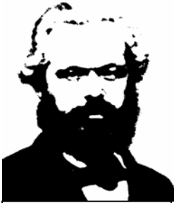
Karl Marx, theorist of capitalism

sphere from the domination of the political. Under capitalism, the worker and capitalist contracted with one another free of the burdens of traditional religious or status relations.