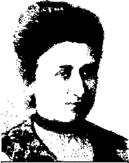
Rosa Luxemburg, socialist leader

In What Is To Be Done , Lenin claimed that trade union activity would produce only a reformist desire for “more” economic goods rather than revolutionary consciousness. Lenin may not have inaccurately predicted the nature of predominant working class consciousness during “normal” periods of capitalist development. Workers under capitalism have more to lose than just their chains. But Lenin’s belief in the privilege of the “vanguard” party—that it can do whatever it wants once it takes power because it represents the workers’ “true” interests—contradicts Marx’s belief in working-class self-emancipation. Though an effective strategy for clandestine organization in repressive societies, Leninism’s track record in democratic capitalist societies is dismal, perhaps because self-described Leninist parties are usually thoroughly authoritarian.